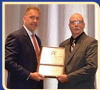
Detention Officer of the Year Page 3