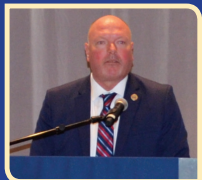
Sheriff of the Year Page 2

A special newsletter from your South Carolina Sheriffs' Association