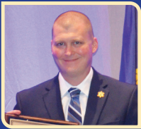
Deputy of the Year Page 3