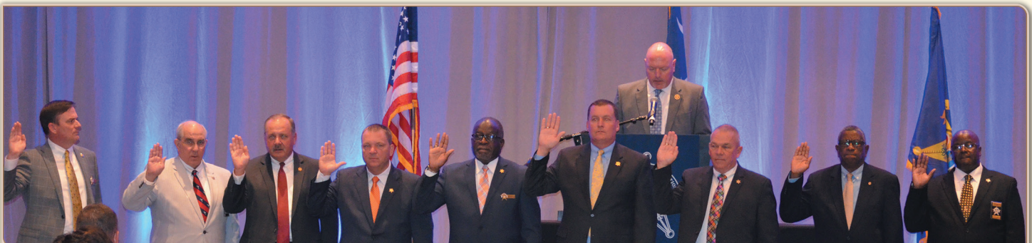
2021-2022 SCSA Board of Directors being sworn in.