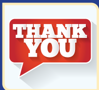
Special Thanks! Page 4