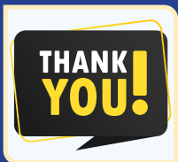
Special Thanks! Page 4